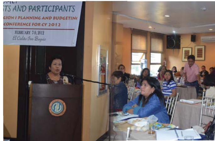
DILG Region 1 conducts the Regional Planning and Budget Conference for CY 2012 in Baguio City.