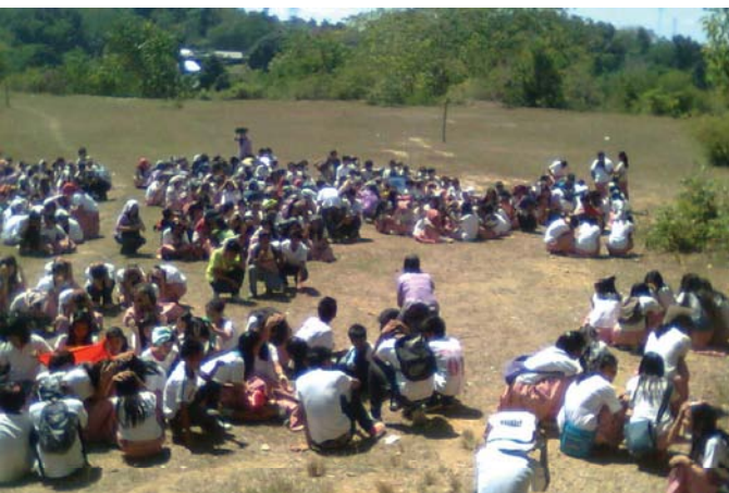
The Municipality of Santo Tomas, La Union conducts an earthquake and fire drill at Damortis National High School. Drills are expected to be done in all public schools of the municipality for the 1st quarter of 2012